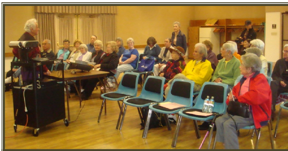
Attentive Emeritus College students at the first day of "Women in American History" class at the Rossmoor site.

The Contra Costa Community College District, founded in 1948 and governed by a publicly elected five-member board, is one of the largest multi-college community college districts in California. The mission of the District is to attract and transform students and communities by providing accessible, innovative and outstanding higher education learning opportunities and support services.